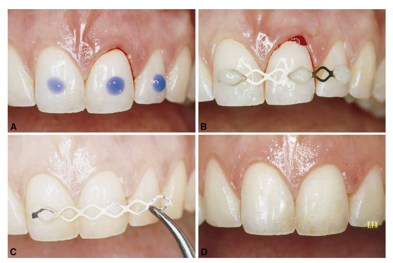
Fig. 2. A) After repositioning the traumatized maxillary left central incisor, minimal etching gel is applied according to the small openings of the TTS. B) Using bonding agent and light curing composite resin, the TTS has been fixed to stabilize the injured tooth. C) At the time of splint removal, the TTS can just be "peeled" off from the tooth surface. D) Final view after splint removal.

The TTS (Titanium Trauma Splint, patent pending) has been developed by the authors in close collaboration with Medartis AG, Basel, Switzerland. The main objective of developing a new device was to optimize current splinting techniques.